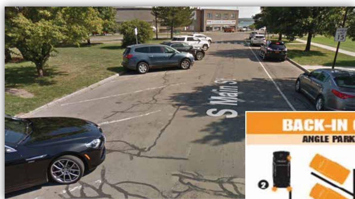
Canandaigua, New York

13 Install back-in diagonal parking on Lincoln Avenue in front of Community Center.